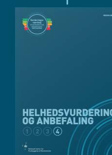
Tool 4: Holistic assessment and recommendation

Based on the analysis, the Infohouse will prepare a holistic assessment of the individual's situation. Based on that holistic assessment, a recommendation will be prepared for the authority that can launch an initiative.