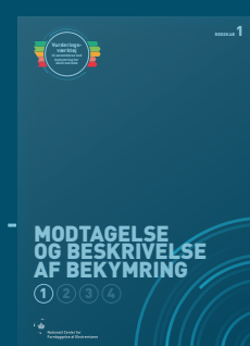
Tool 1: Receipt and description of the concern

MUNICIPALITY: Even if the reported concern is assessed as being a security threat, the municipality is still required to launch professional social preventive initiatives targeted at the individual in question and his/her family or network if that is required.